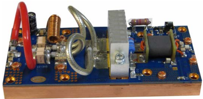
Dimension : 110 X 50 X 30 mm Weight : \leq 0.4Kg